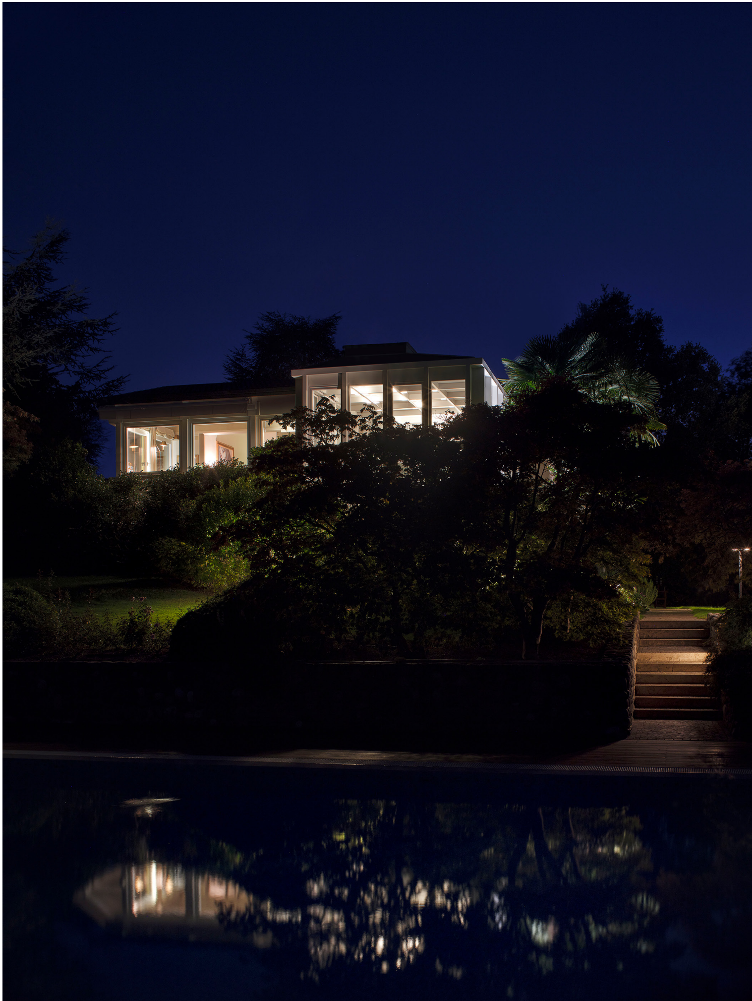
#VIC 2024 A Secret Pavilion Vicenza, IT Extension 28mq