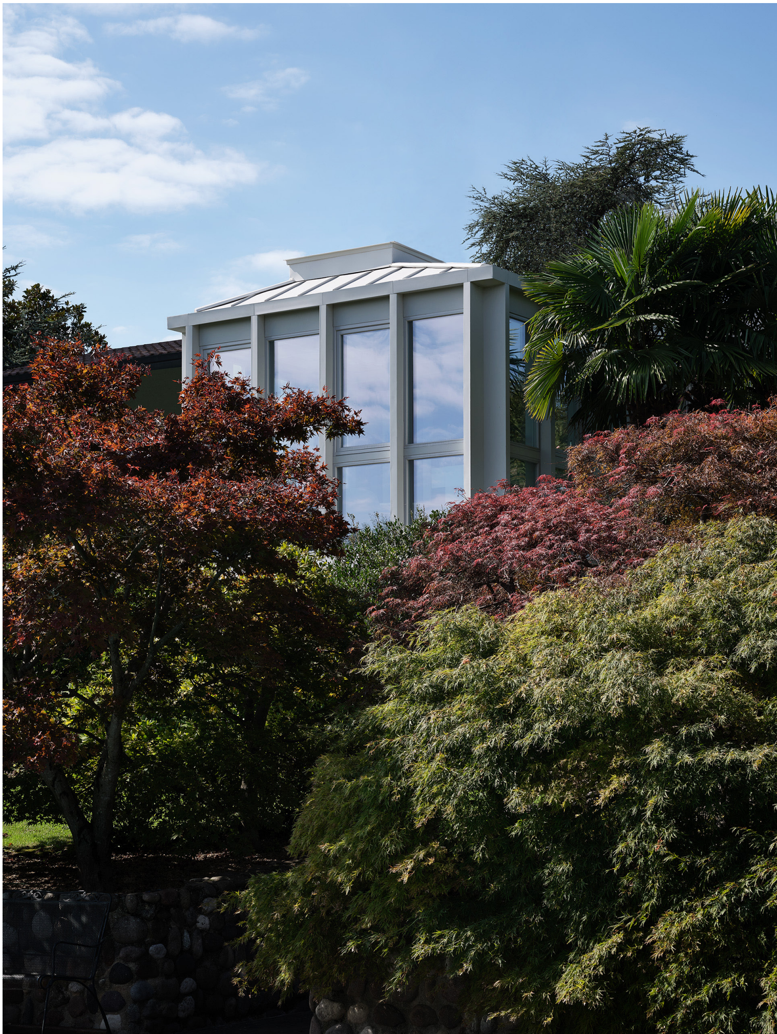
#VIC 2024 A Secret Pavilion Vicenza, IT Extension 28mq