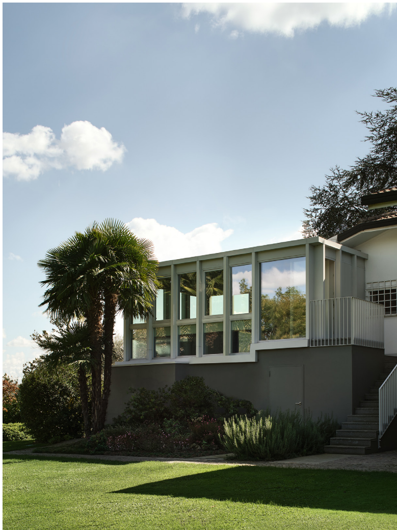
#VIC 2024 A Secret Pavilion Vicenza, IT Extension 28mq