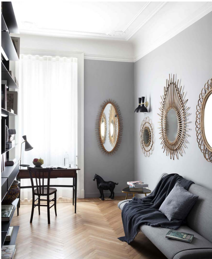
#VCN 2017 Traits d'Union Milan, IT Hi-End Residential 150sqm