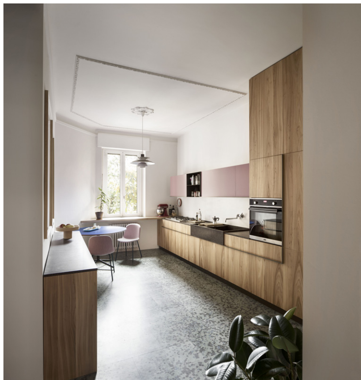
#POG 2019 Wunderkammer Milan, IT Apartment in Piola